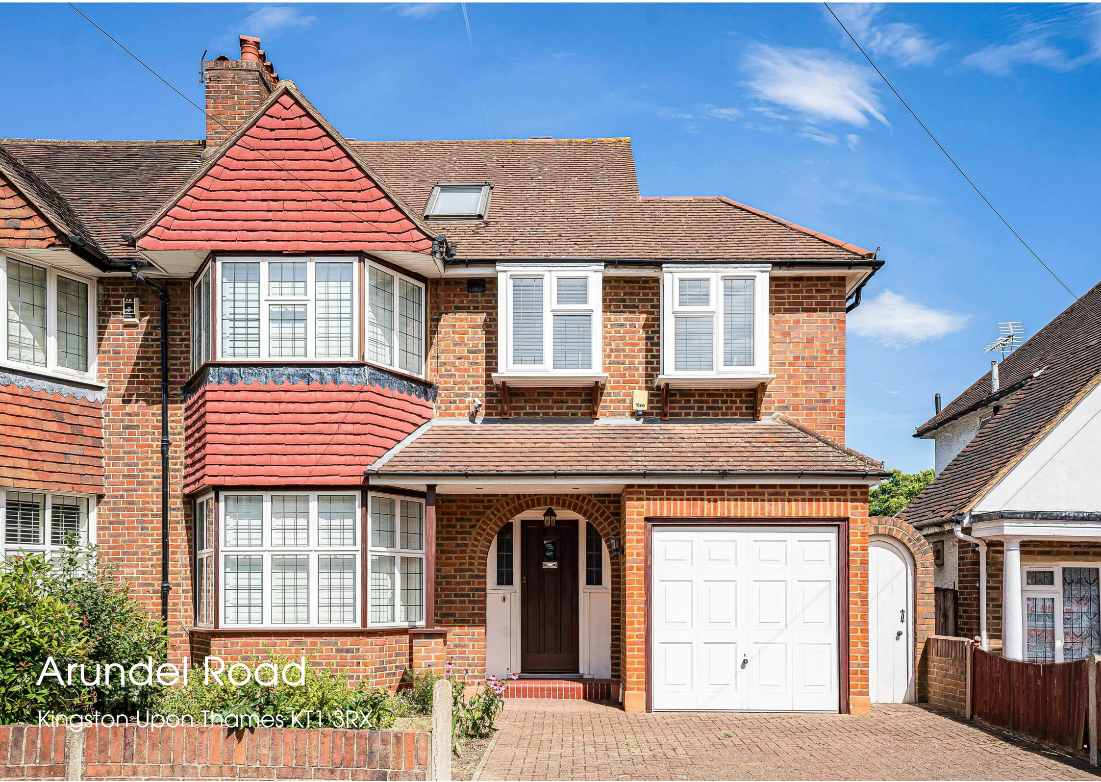
Arundel Road Kingston Upon Thames KT1 3RX